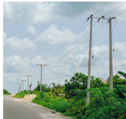
Installation of electrical poles in a host community for 33kV Power Distribution Networks.