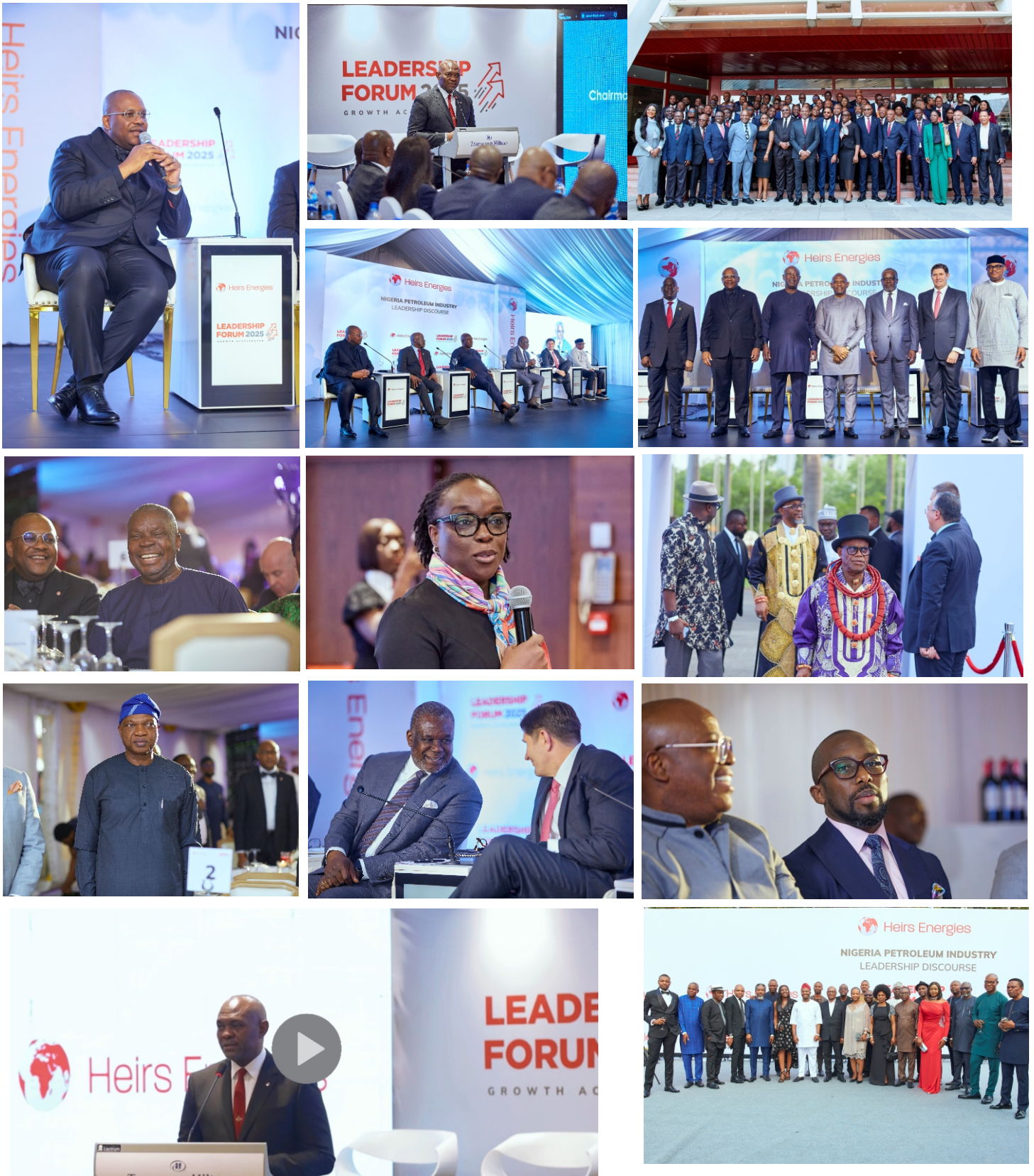
Click to Watch LF Wrap Up Video